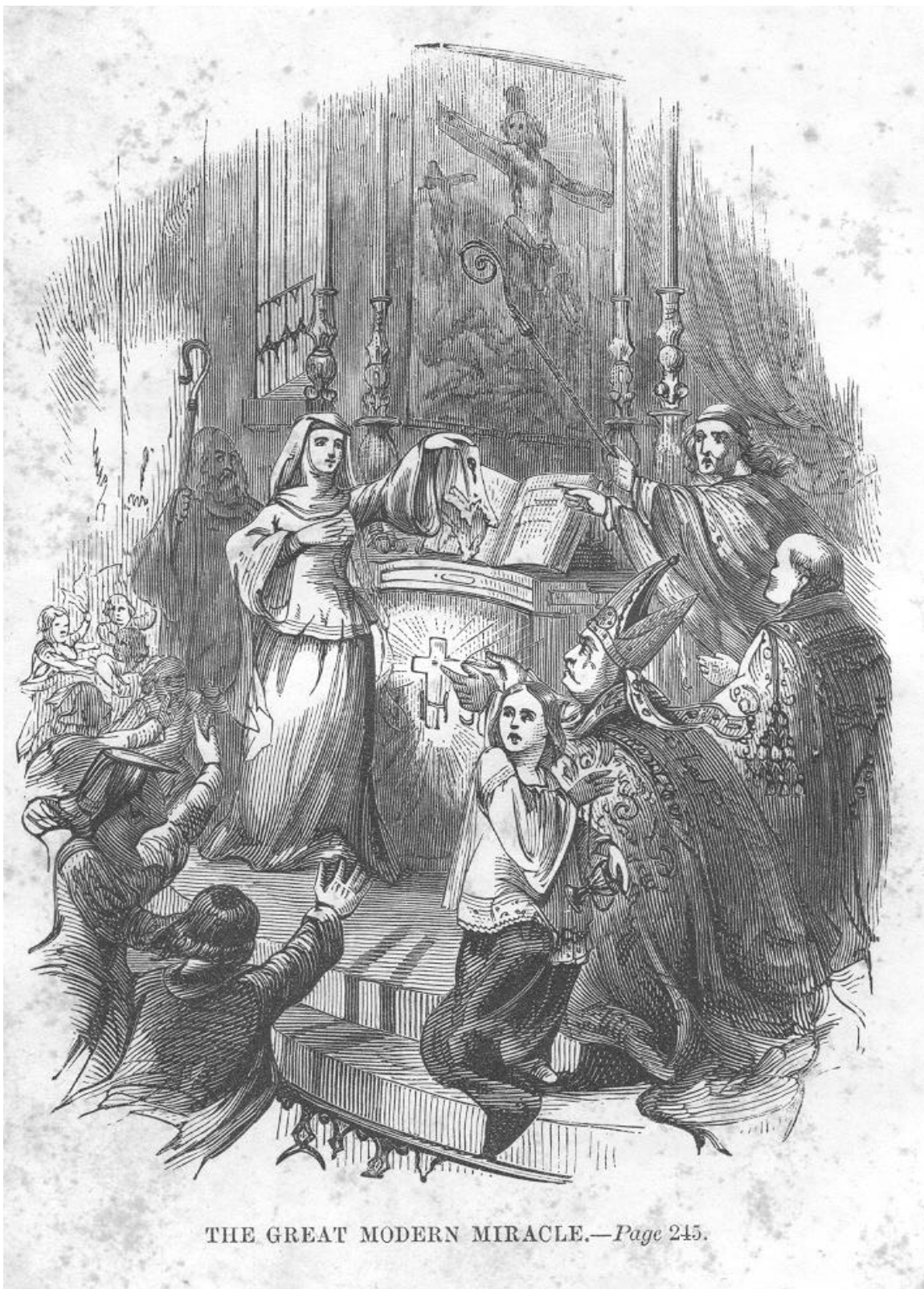
THE GREAT MODERN MIRACLE.—Page 245.